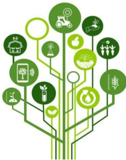
CLIMATE SMART AGRICULTURE