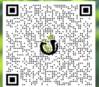
SCAN ME TO DOWNLOAD OUR PRODUCT CATALOGUE

We offer affordable, innovative, and sustainable farming solutions and products, designed to increase yields build soil fertility, reduce costs, and improve crop quality for farmers.