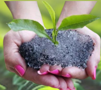
WATER SAVING GEL