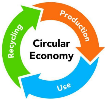
GREEN CIRCULAR ECONOMY