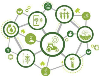
IMPROVED SOIL HEALTH